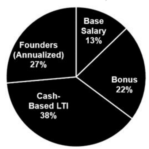
CEO - Annualized 2017 Pay Mix